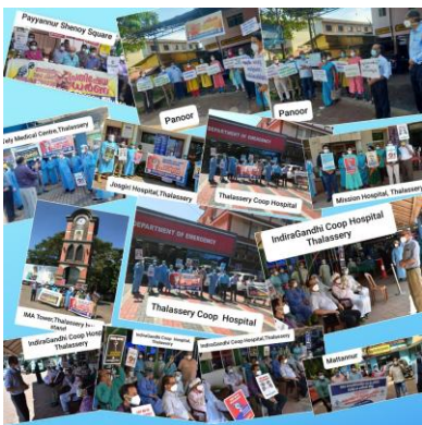
IMA TELlicherry NEWS LETTER DECEMBER 2020